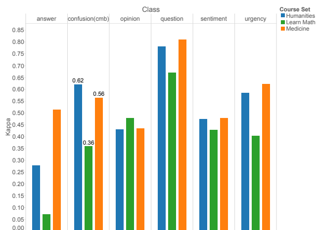
Figure 2: Constituent Classifier Performance. Confusion(cmb) is the combined classifier.

The combining function of our combined classifier consistently determined that the constituent classifiers for the question and urgency variables were particularly indicative of confusion (see Table 4). Figure 3 shows the results of an