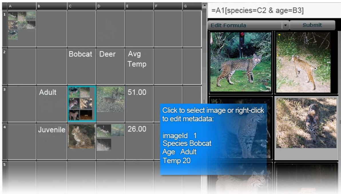
Figure 1. PhotoSpread Interface (image retouched for clarity).

materials. Last but not least, an amateur photographer may also want to organize and analyze his travel or family photos.